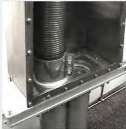
Housing encloses all moving parts to eliminate external pinch points and support the flex tube