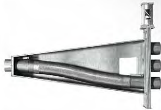
3 - WAY