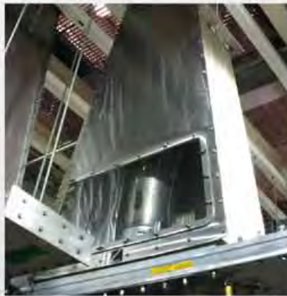
8" (203mm) Flex Tube Diverter handling PVC compound