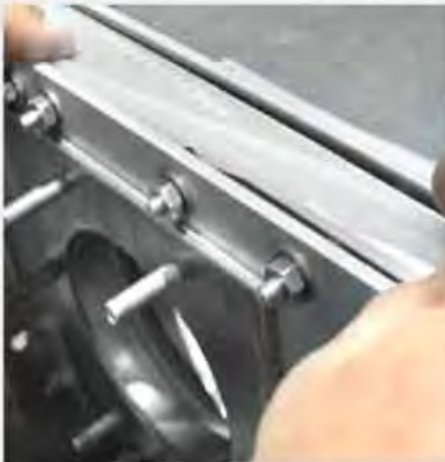
Shim removal for seal adjustment while valve is in-line