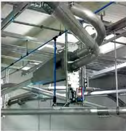
6" (152mm) Flex Tube Diverters handling coffee beans